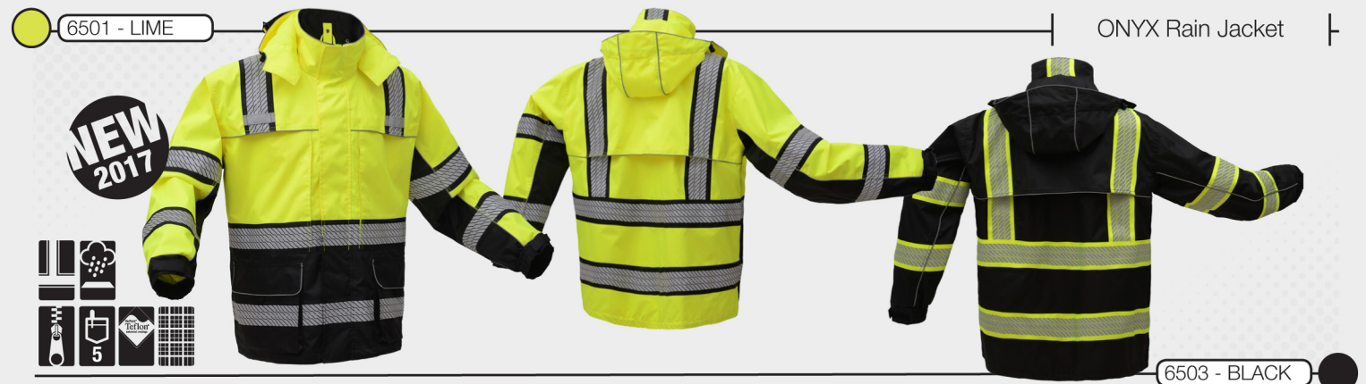
6501 - LIME | ONYX Rain Jacket