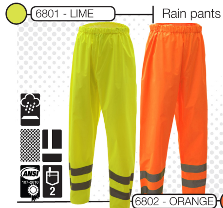
6801 - LIME | Rain pants