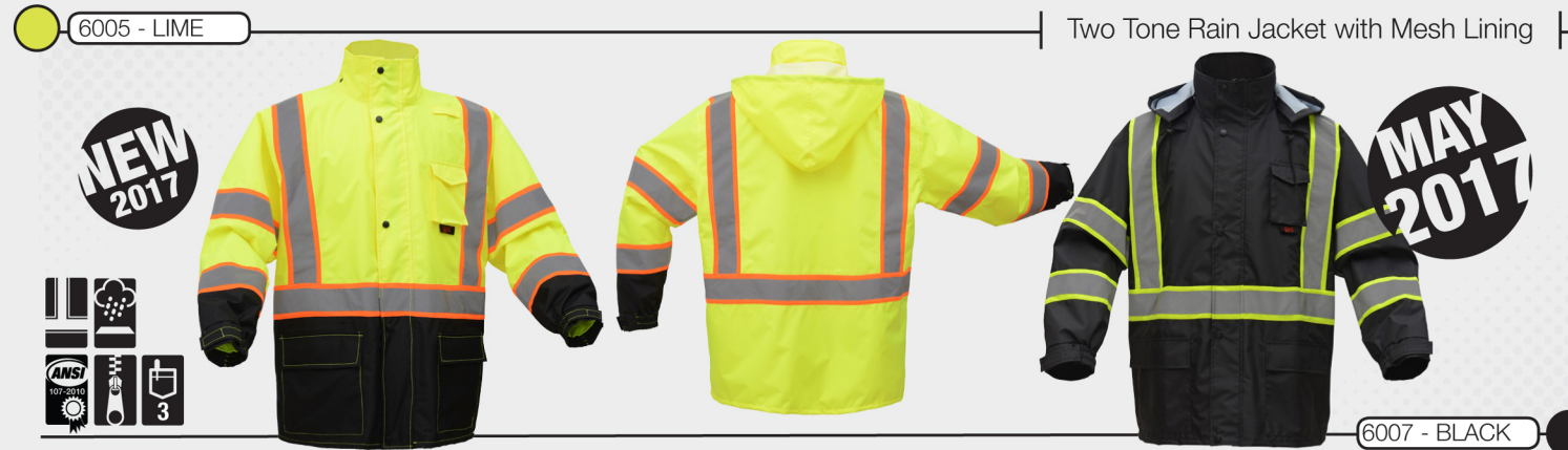
6005 - LIME | Two Tone Rain Jacket with Mesh Lining