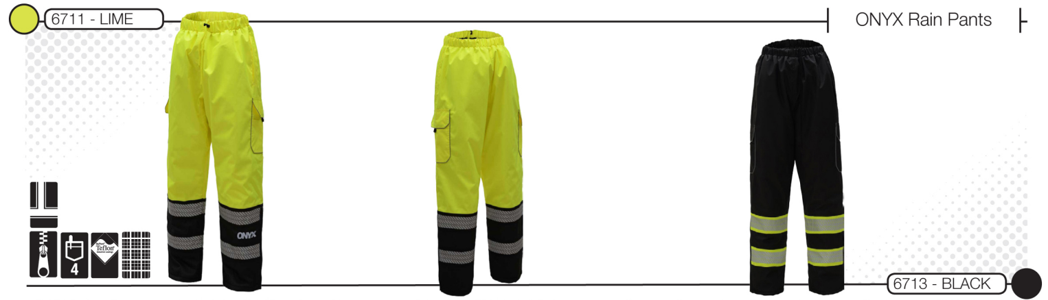
6711 - LIME | ONYX Rain Pants