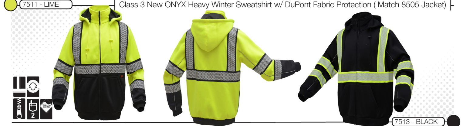
7511 - LIME | Class 3 New ONYX Heavy Winter Sweatshirt w/ DuPont Fabric Protection ( Match 8505 Jacket)