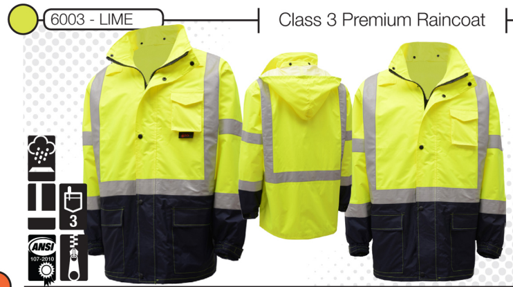
6003 - LIME | Class 3 Premium Raincoat