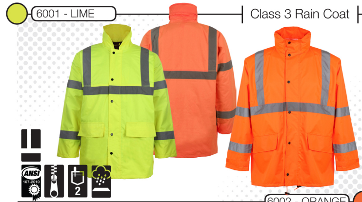
6001 - LIME | Class 3 Rain Coat