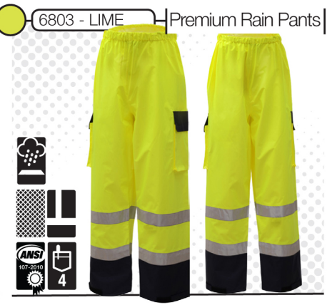
6803 - LIME | Premium Rain Pants