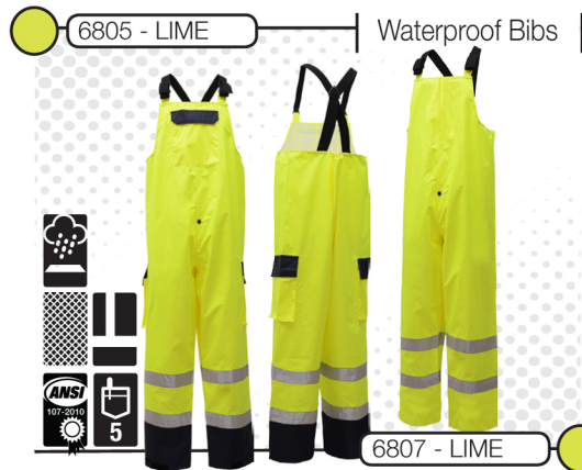
6805 - LIME | Waterproof Bibs